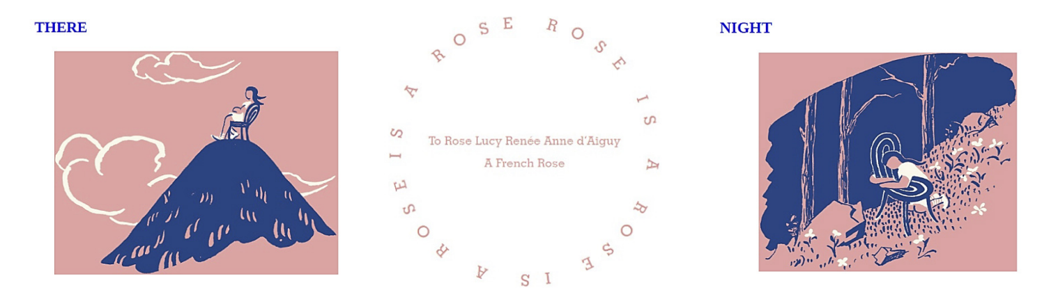
Figure 2. Clement Hurd's illustrations for the US edition of The World is Round (1939) by Gertrude Stein; pictures taken from: collections.library.yale.edu . collections.library.yale.edu/catalog/10544206.