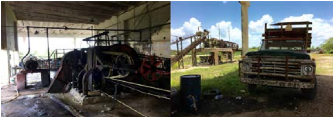
Figure 4-5. A decorticator (desfibradora) at the José María Morelos plant between Motul and Telchac Puerto. Source: Lundberg, H. (photographer). August 2017.

With the technological innovation of the decorticator (desfibradora), a mechanical device [that] was invented and perfected by Yucatecans during the 1850's, was the industry able to cut production costs and meet rising demand. Desfibradoras soon became standard operating equipment on all large plantations. By 1860, rasping machines each, on average, produced more than a bale (350 pounds) of fiber a day. Improvements in technology continued throughout the auge, and with the introduction of steam power to the machine house in 1861, henequen production soared (Wells, 1982, p. 229).