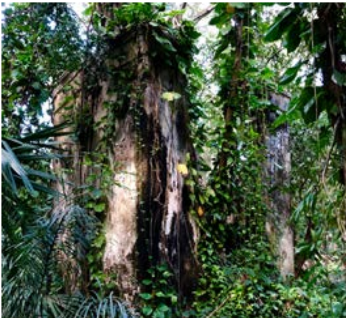
Figure 8. House where slaves were left to die. December 2017.