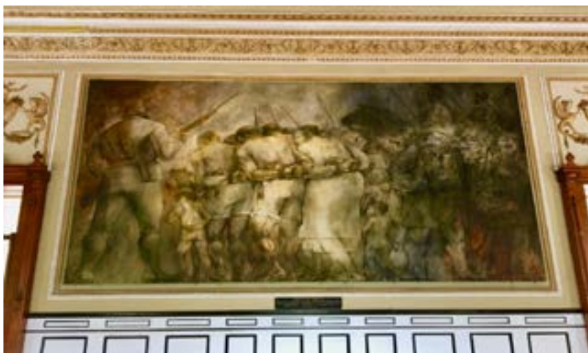
Figure 2. Venta de Indios (mural of the trade of Mayan slaves, 1848-1861).