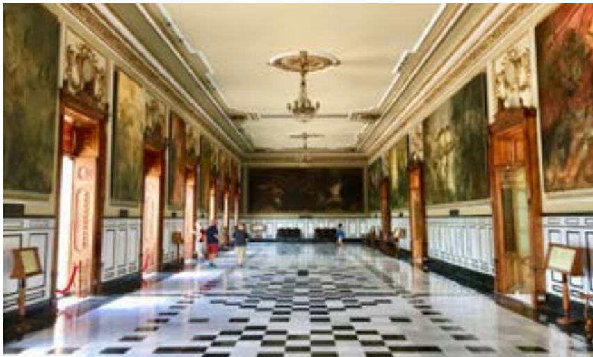
Figure 1. Panoramic view of Palacio de Gobierno del Estado de Yucatán, Merida, Mexico.

Visiting the Palacio de Gobierno del Estado de Yucatán in Merida, Mexico, is a paradoxical experience. The stunning elegance of the place (Figure 1) combined with the almost 400 years of enormous brutality its murals communicate (Figure 2) creates a major contrast effect.