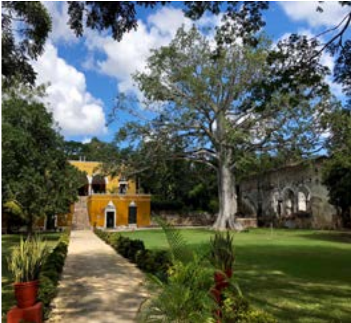
Figure 7. Entrance to Hacienda Uayamón, Campeche.

As so often in historical and contemporary Mexico, the contrasts are to be found all around us and in immediate vicinity to each other: Immediately when entering the beautiful ex-hacienda henequenera, Hacienda Uayamón in Campeche, one gets a more-than-enough obvious illustration of the enormous wealth accumulated (Figure 6). But less than 100 meters from the main building, just by slipping into the nearby jungle, one finds the remaining of the house where enslaved indigenous peoples of Yucatán having upset their Master was thrown in, alive, to fade away into death (Figure 7):