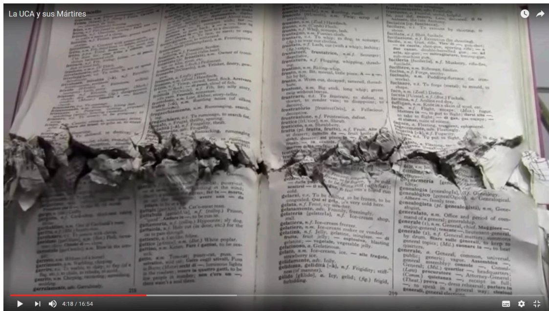
Figure 2. A book damaged during the attack to the Jesuits home. Said to be a Bible, is actually a dictionary.

The online experience of visiting the museum hand by hand with a sympathetic follower—Pastor Ochoa—gives the user an intense feeling of emotional distress, since his words and pitch convey his own feelings toward the site and its history. Listening to his description of the objects placed there, a new meaning arises: history is felt through the experience of a narrator whose presence at this highly charged place turns into a vicarious practice.