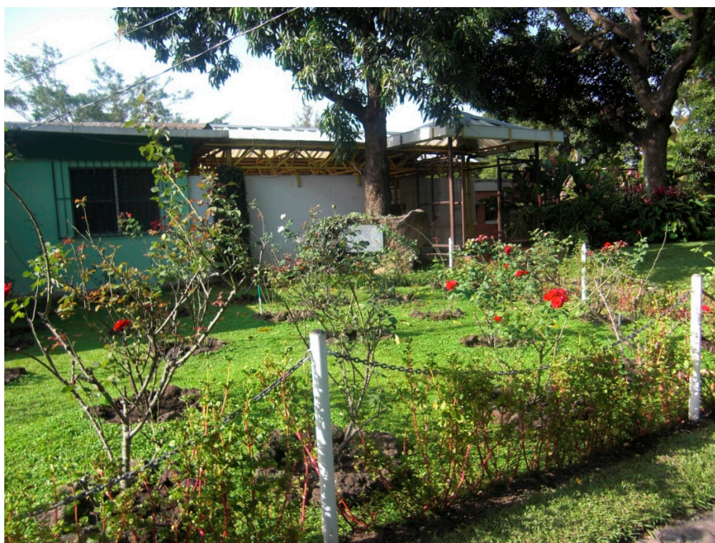
Figure 1. Garden of the Roses. The place where the UCA martyrs were executed.

“Hall of the Martyrs: The Tours” 3 begins with the rose garden (Figure 1), where the bodies of the Jesuit priests were found early in the morning of 16 November 1989. They had been slayed at the site. 4